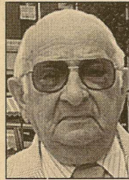
JOSEPH TWARDUS Former House Rep.

Please go to www.taskerfh.com for more information or to sign the on-line guest book.